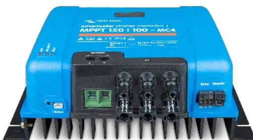
Solar Charge Controller MPPT 150/100-MC4 without display