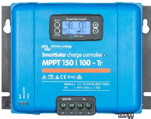
Solar Charge Controller MPPT 150/100-Tr with pluggable display